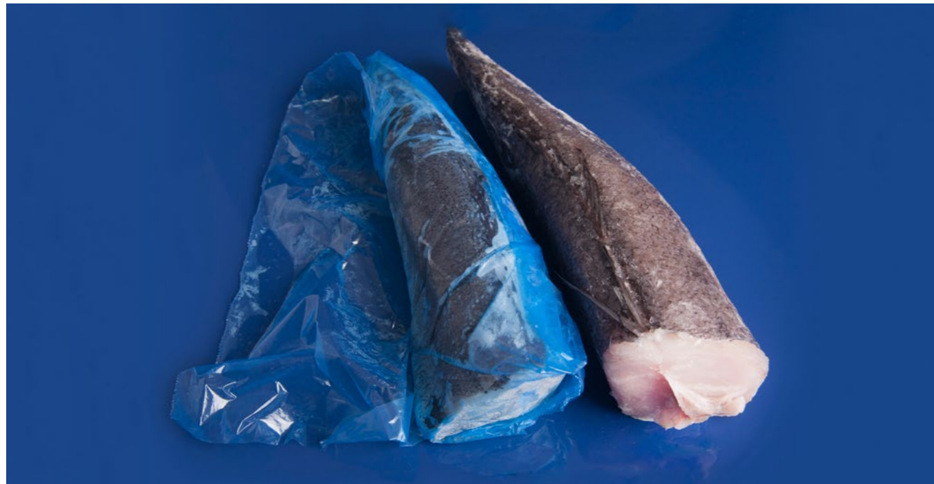
Cape Hake HG&T