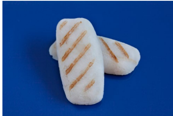
“Hand” Moulded IQF Cape Hake Portions (with grill marks)