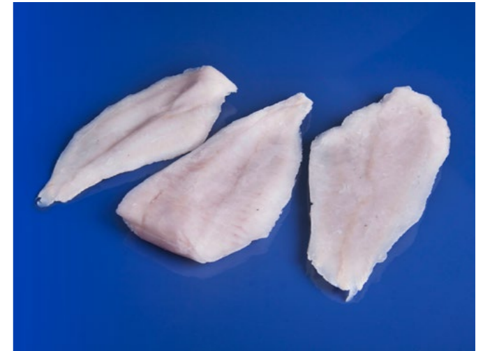
Cape Hake Fillets - High Seas