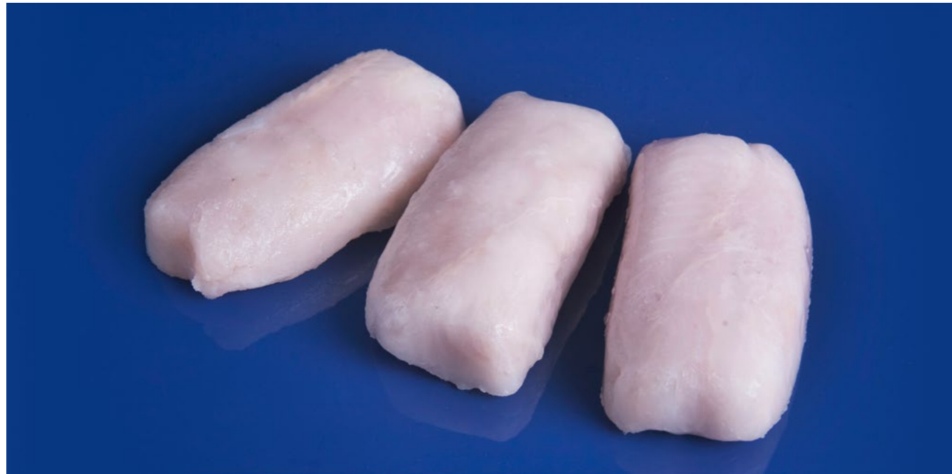
“Hand” Moulded IQF Cape Hake Portions