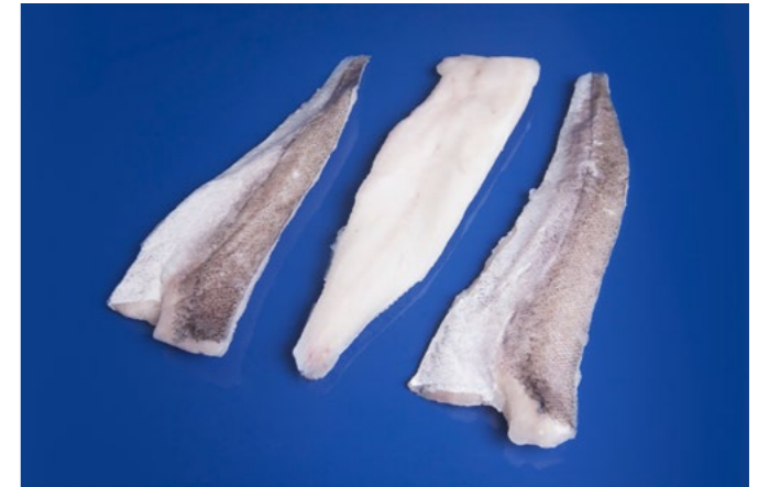
Skin-on Cape Hake Fillets