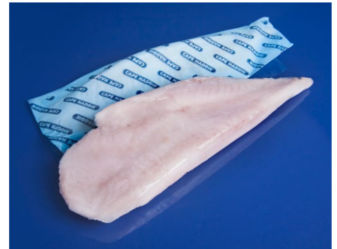
Cape Hake Fillets - Cape Haddie