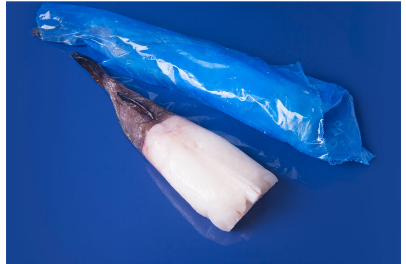
Skin-on Monk Tails