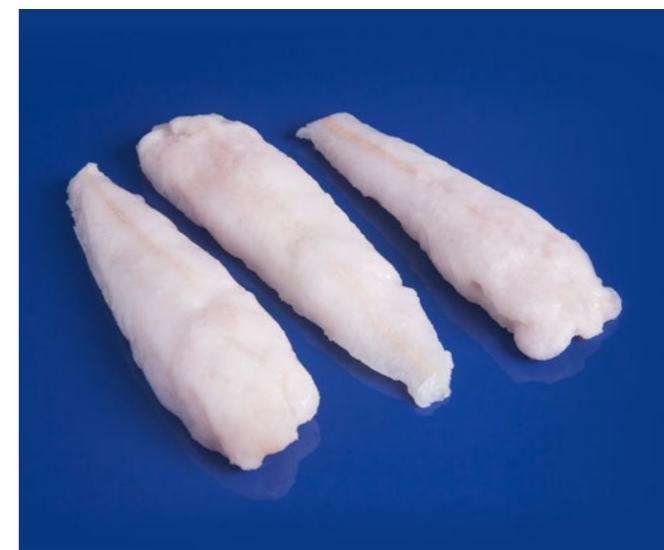
“Married” IQF Cape Hake Fillets