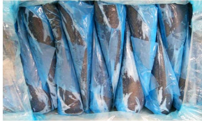
Cape Hake HG&T