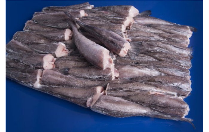
Cape Hake H&G