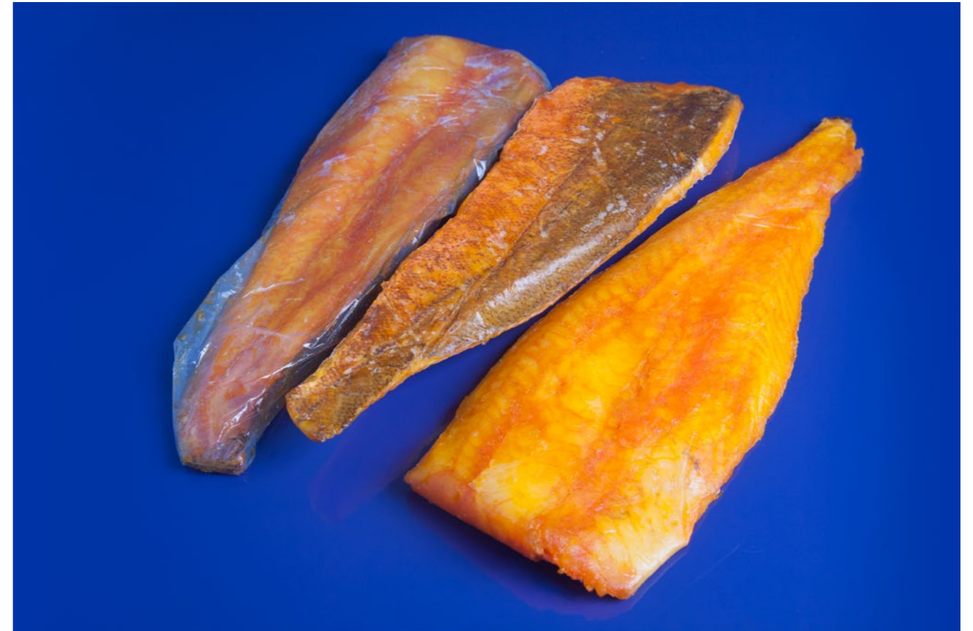
Skin-on Smoked Cape Hake Fillets