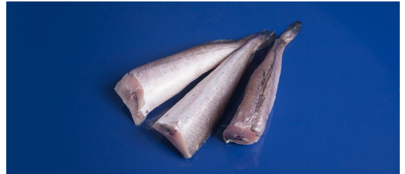
Cape Hake H&G