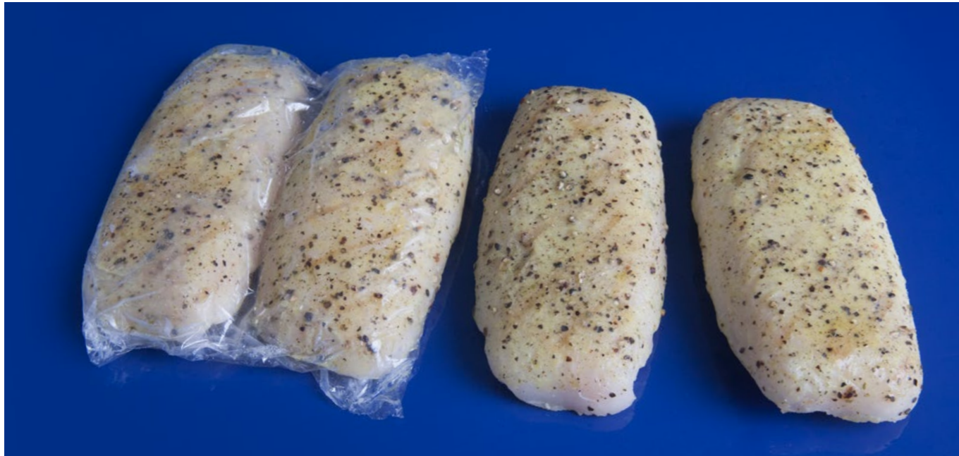
Cape Hake Grills