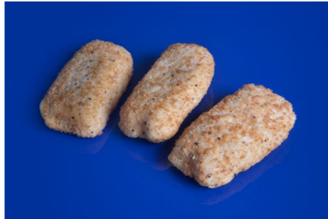
Coated Cape Hake Portions