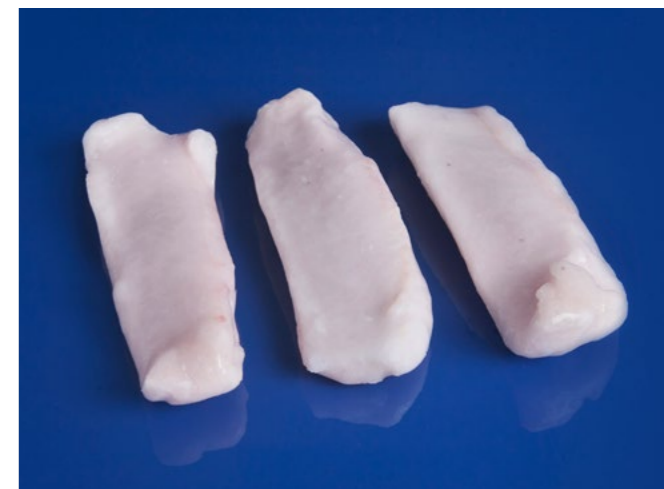
IQF Cape Hake Loins