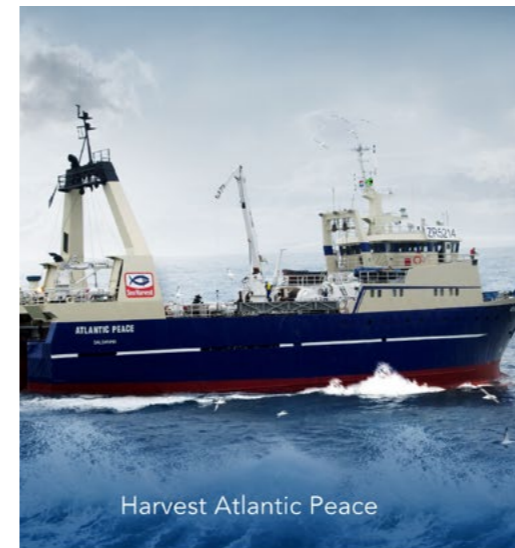
Harvest Atlantic Peace