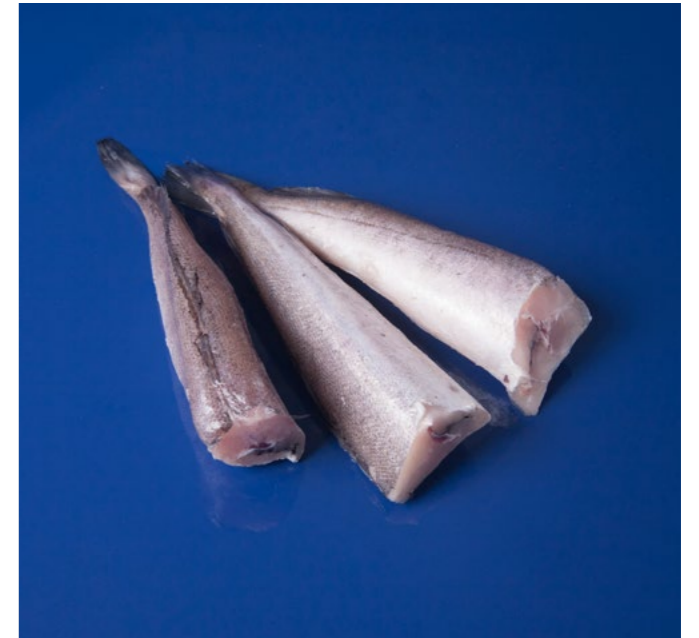
Baby Hake H&G